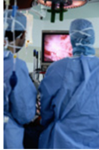
Arthroscopic treatment of meniscal tears

incision. This provides a clear view of the inside of the knee. Your orthopaedic surgeon inserts miniature surgical instruments through other small incisions to trim or repair the tear.